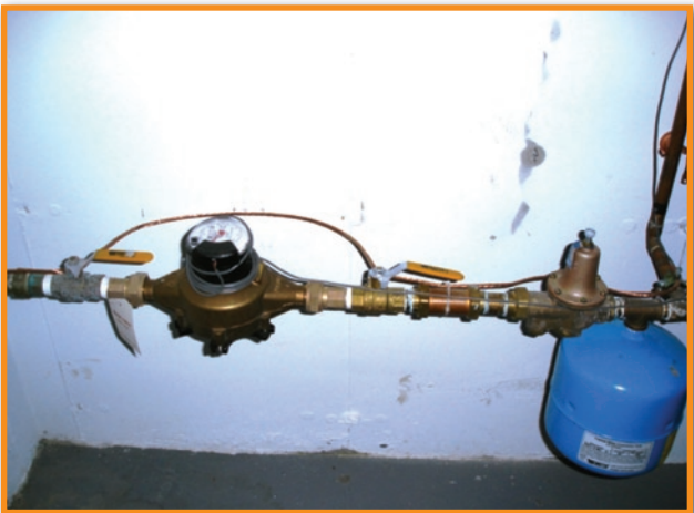
Residential meter, Backflow Preventer and expansion tank.

Cross connection control is a key element to protect against unforeseen contamination of your drinking water. Backflow, backsiphonage or return of contaminants to your drinking water through an unprotected connection can be devastating. Last year a hydro seeding company caused a contamination incident that left hundreds of customers without potable water for over a week. This incident became the impetus to reevaluate our existing cross connection control program for ways to better protect your drinking water supply from contamination. Revisions to this program now require all existing customers to install backflow protection over the next fifteen years. This phased approach affords the opportunity for our customers to plan for their installation. We need your help to protect ourselves from a potential crisis that could start in your own home or at a neighboring facility. Installation of an appropriate backflow prevention device eliminates this problem. The revised cross connection control program also incorporates an assurance element that includes termination of service for noncompliance. Take action now; don't be caught in the last minute rush. Additional information on this program can be obtained by calling our office at 401-821-9300.