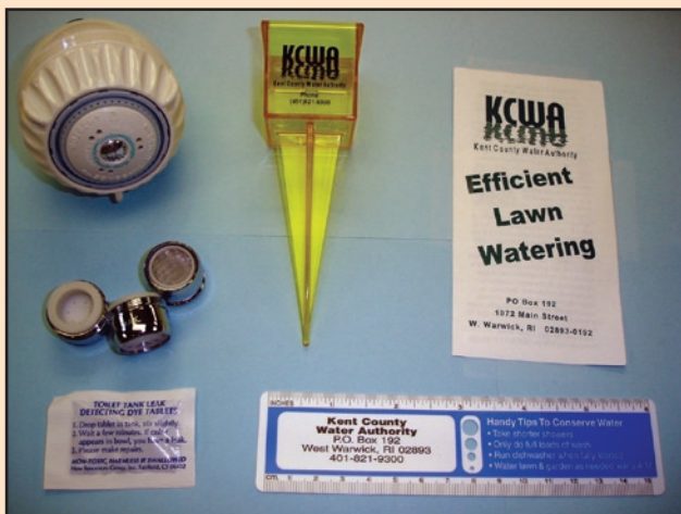
KCWA conservation kit and rain gauge.

MRDLG: Maximum Residual Disinfectant Level Goal, The level of drinking water disinfectant below which there is no known or expected risk to health. MRDLGs do not reflect the benefits of the use of disinfectants to control microbial contaminants.